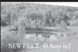
NEW PRICE. 40 Acres m/l

4110 W. Rogers Boulevard Skiatook School District $249,900