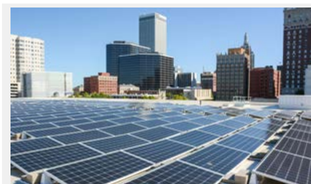
Rooftop solar panels on the Tulsa City-County Library's downtown library.

By: Journal Record Staff | May 15, 2018 | 0