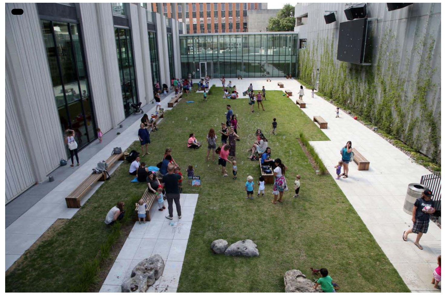
A grassy area outside the Central Library provides a nice venue for the Tulsa City-County Library's summer reading program.