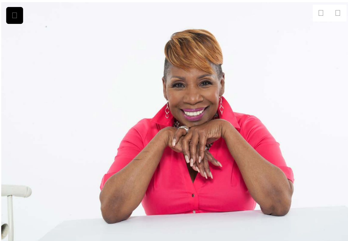
Iyanla Vanzant, best-selling author and life coach, will accept the 2018 Sankofa Freedom Award on Feb. 24 at Central Library. The award is given to a nationally acclaimed individual who has dedicated his or her life to educating and improving the community.