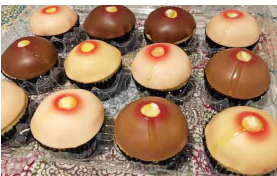
Watch the video on our Facebook page SkiatookJournal. COURTESY

"The pimple cupcakes were a custom order from a local medical office," Jackson said. "They wanted