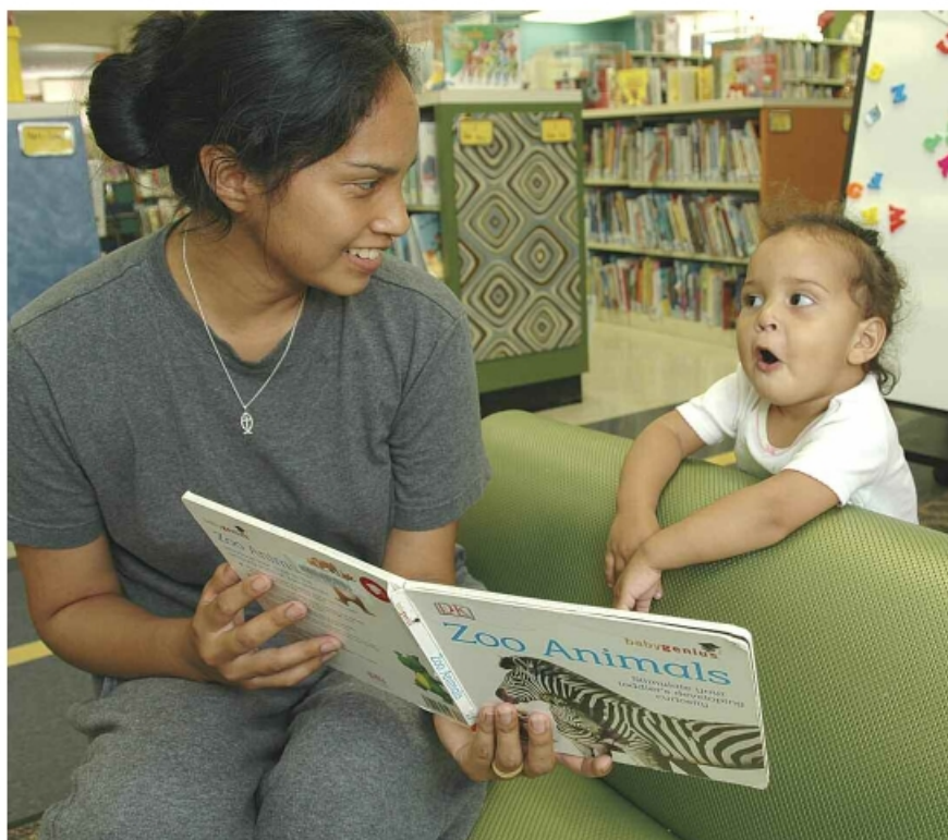
READING AND TALKING TO KIDS BUILDS THEIR BRAINS.

• Your favorite places you went or things you did in the summer when YOU were a kid.