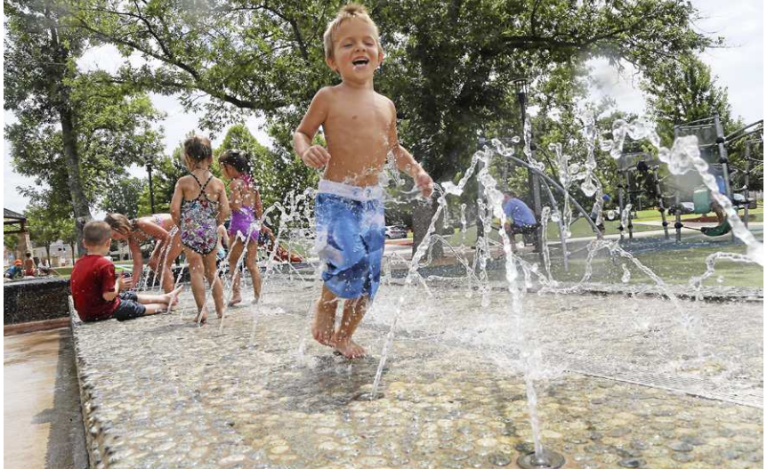
Kids run through a splash pad at 41st Street and Riverside Drive in Tulsa.

The splash pad and fountains at the 41st Street Plaza Complex are open from 9 a.m. to 9 p.m. through Oct. 1 for children of all ages.