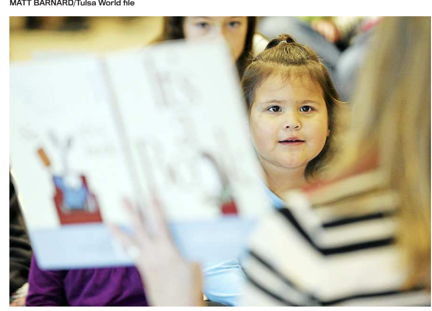
Story time for toddlers through second grade is held at 10 a.m. every Thursday through September at the Linnaeus Teaching Garden.

The water facilities are closed every so often to be cleaned