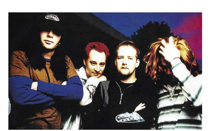
The Nixons will perform at Cain's Ballroom for a reunion show Friday.