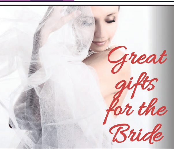
10% Off Bachelorette Gifts w/this ad

Empowering your sexual health 7 days a week Four Tulsa Locations: