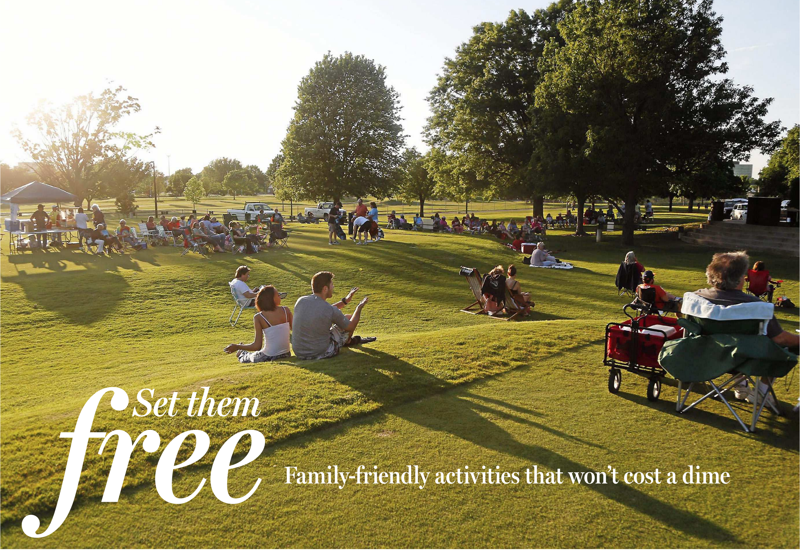
A crowd gathers outside for a free concert at LaFortune Park's gardens area.