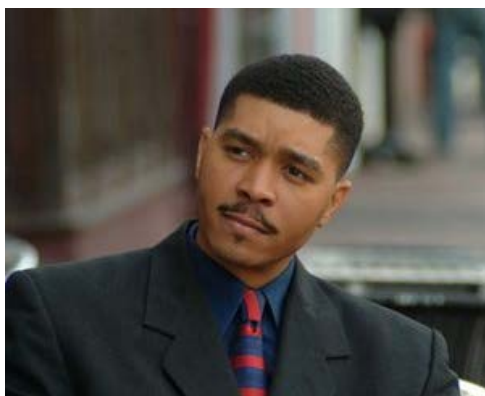
Author Omar Tyree

Posted: Monday, January 30, 2017 12:00 am | Updated: 12:09 am, Mon Jan 30, 2017.