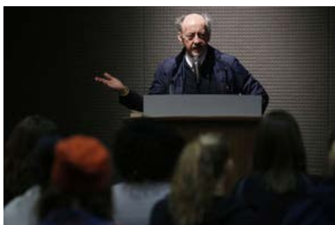
Poet Billy Collins, winner of the Helmerich Distinguished Author Award, speaks to a group of students about poetry at Central Library on Friday.