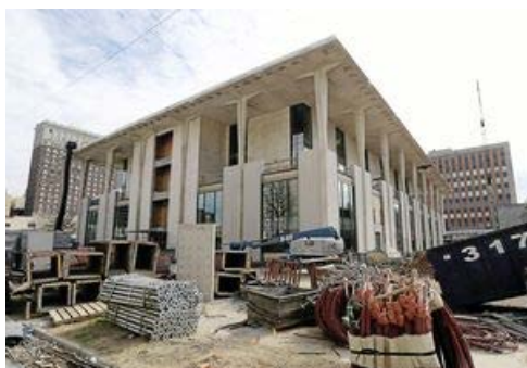
Construction continues at Tulsa's Central Library on Friday. The library is expected to reopen this summer.

Posted: Thursday, June 9, 2016 12:15 am | Updated: 3:21 pm, Thu Jun 9, 2016.