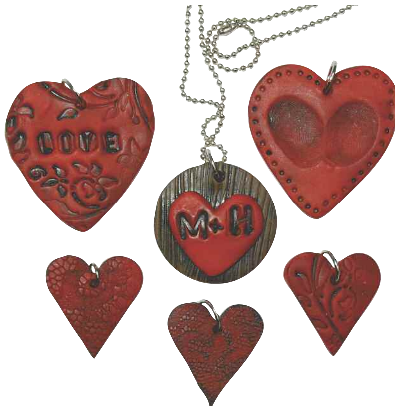
CLAY VALENTINE HEARTS (ABOVE). HEART PAPERCHAIN (BELOW).