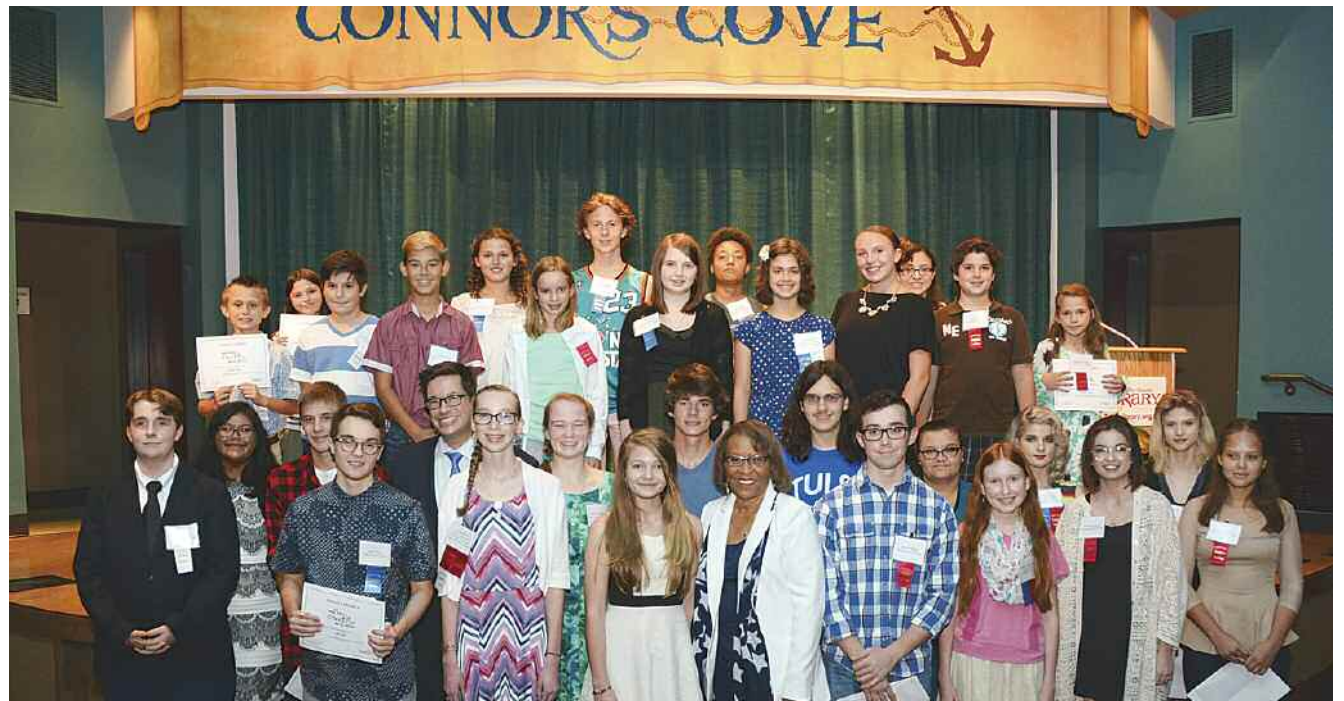
SHARON DRAPER, WINNER OF THE 2015 ANNE V. ZARROW AWARD FOR YOUNG READERS' LITERATURE, IS PICTURED WITH WINNERS OF THE 2015 YOUNG PEOPLE'S CREATIVE WRITING CONTEST.