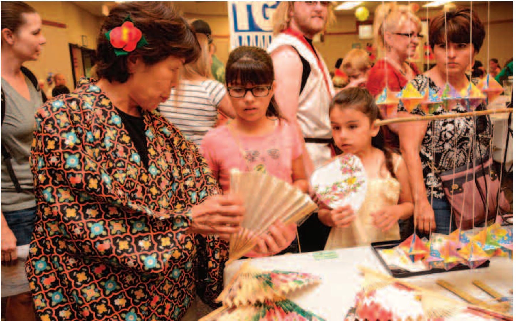
Celebrate and learn about the customs and traditions of Asian-Americans at the 13th annual Asian-American Festival - Saturday, June 6; 10:45 a.m.-2:30 p.m. at the Martin Regional Library.

Get out and GO in the Tulsa metro area. Find these events and more at www.tulsakids.com/calendar .