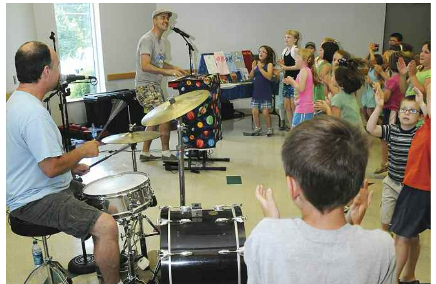
SUGAR FREE ALLSTARS

• Sugar Free Allstars: Fun & Funky Music for Families, June 9, 11 a.m.-Noon and 2-3 p.m. All toes will be tapping when this duo sets up the drum kit and plugs in the Hammond B-3 organ.