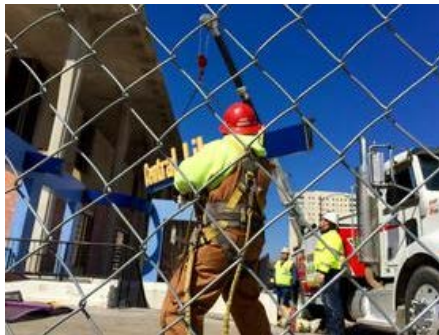
Workers take down the last sign at downtown Tulsa's Central Library. The branch is undergoing a $50 million renovation.