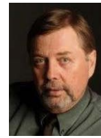
Host of Swing on This