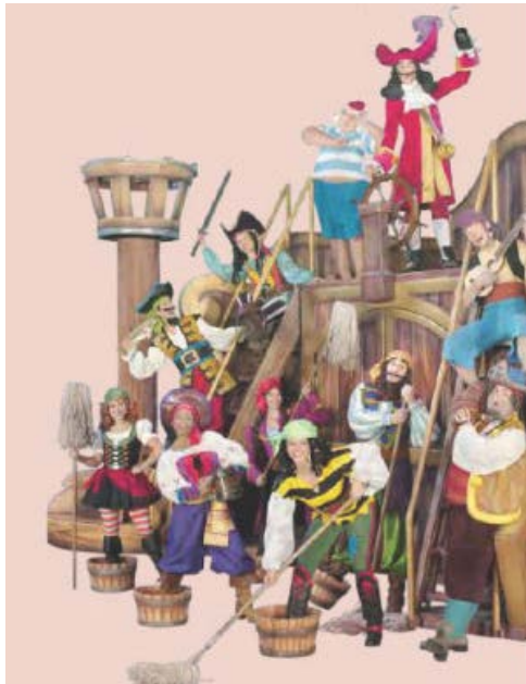
Pirates invade Tulsa as "Disney Live! Pirates and Princesses" hits Tulsa on Saturday and Sunday.

So the kids are back in school, back in their old habits in the doldrums of winter and probably needing a little fun and excitement.