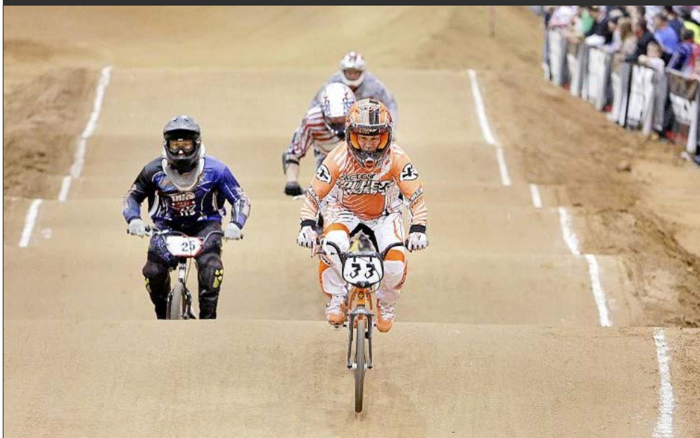
The ABA Sooner Nationals return to the Ford Truck Arena at Expo Square this weekend.

Posted: Thursday, January 23, 2014 12:00 am | Updated: 6:34 am, Thu Jan 23, 2014.