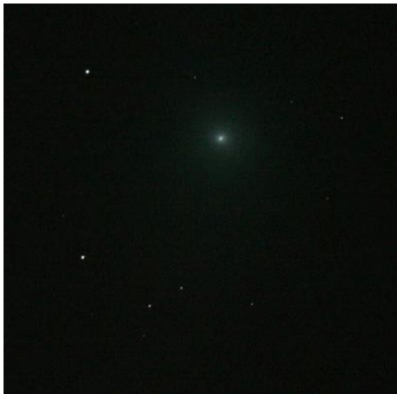
The Green Comet Lulin is seen (upper-right) in the Constellation Virgo in this 2009 photo. What will you see when you check out the night sky at Tulsa's Central Library's planetarium experience?